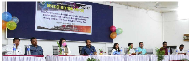
IT News Imphal, Sept 12:

A One-Day Orientation Programme on Voter Enrolment for Eligible Youths cum linking of Aadhaar number for already enrolled LGBT and PwDs in Electoral Roll was convened today from 11:30 AM onwards at Panchayat Bhavan Hall, DC Office Complex, Porompat. The Programme was convened as a part of Activities under Systematic Voters' Education and Electoral Participation (SVEEP) Programme in Imphal East District following the latest instructions issued by the Election Commission of India (ECI) regarding linking of Aadhaar with Elector Photo Identity Card (EPIC).